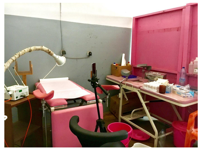
Figure 2 Device including the gynecological table, smartphone and tripod.

Once the patient record was created, the cervical images were acquired in a precise sequence: native, VIA, VILI and posttreatment whenever this was performed. The flash